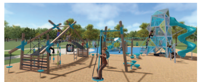
MADSEN PARK CONCEPT – OPTION 2

updates as well. Summit Square Park will also receive a new playground and updated amenities.