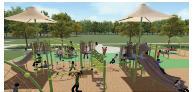
MADSEN PARK CONCEPT – OPTION 1

With construction wrapping up at Commons Park, two of our neighborhood parks will be renovated in the summer and fall of this year. Flanery Park will receive new tennis and pickleball courts, a new playground, walking paths, parking area and basketball court. This park has a rentable park shelter that will receive